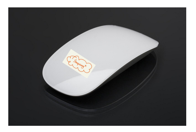
Simpsung® Super Useful Nice Beautiful Cool Wow Mouse Price: $420 (The Beautiful Simpsung Mouse that Claud saw)

After this incident, Claud knew the basics of how to prevent being defrauded. A few weeks later, he decided to buy a mouse for his Simpsang computer, and he went to another shopping website called 'Mason's Shop' (which was in fact another website created by the scammer) and found a perfect mouse. He then bought the mouse by only looking at the picture, without reading the product description at all.